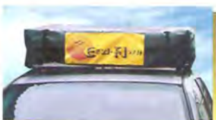
Load bars clamp onto existing bars of vehicle.