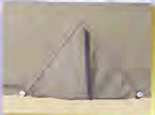
Velcro on bottom flap seals off tent completely against insects.