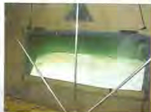
Bigger windows with internal privacy flymesh that can be zipped open.