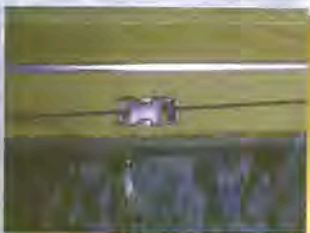
Elastic internal bungy systems helps in closing the tent.