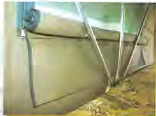
Two handy elongated internal pockets.