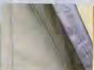
Double stitching throughout increases durability.