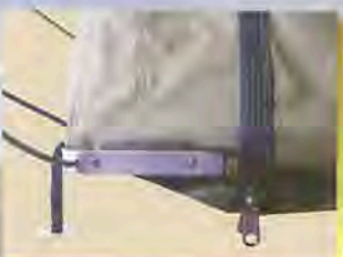
Stainless steel inserts add strengthening for flysheet and canopy spring steel support rods.