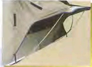
Windows and flysheets are held up by spring steel rods.

Our most popular tent now with many improved features.