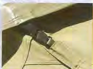
Aluminium rods keep the flysheet away from the tent for better ventilation. Plastic clips allows flysheet to be easily removed.