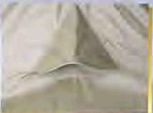
Built-in air-vents allows extra ventilation.